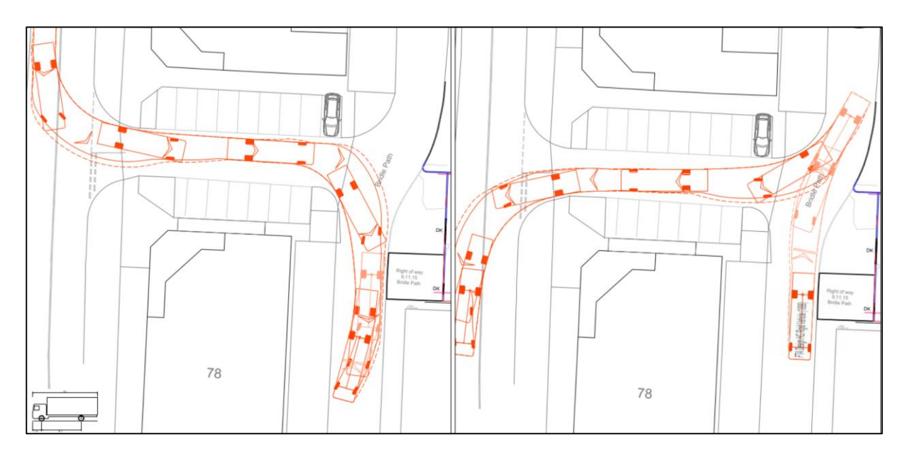
Vehicle tracking for 10m rigid